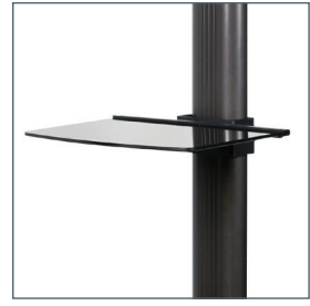
Includes optional 8mm tempered glass shelf. Ideal for holding DVD, Blu-ray players or game consoles.