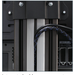
Integrated cable management for a clean and tidy installation.