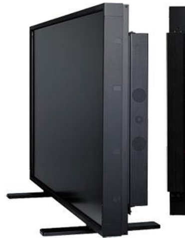
SP-RM1 Front /Side View